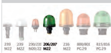
Sizes of Permanent Beacons